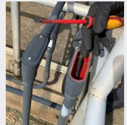
Caps on conduit at these sedimentation basins had been left open.

Wastewater Treatment Plants can have sedimentation basins designed to collect runoff water to allow solids removed in runoff water to settle out. Construction of these basins has become a management practice to help control erosion and environmental degradation. These sedimentation basins can use up to tens of thousands of feet of cable and conduit, making using the right cable and inventory/delivery crucial.