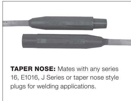
TAPER NOSE: Mates with any series 16, E1016, J Series or taper nose style plugs for welding applications.