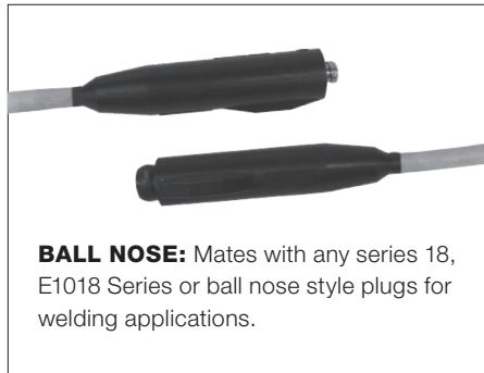
BALL NOSE: Mates with any series 18, E1018 Series or ball nose style plugs for welding applications.