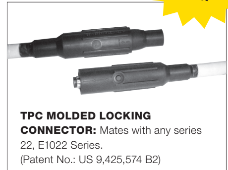
TPC MOLDED LOCKING CONNECTOR: Mates with any series 22, E1022 Series. (Patent No.: US 9,425,574 B2)