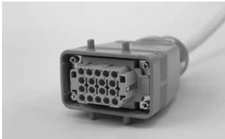
Double Bayonet (4 Locking Pegs) Top Entry Style

Rectangular connectors present a wide range of options for designing and mating with existing equipment. The inserts, which can be changed out within any hood of corresponding size, use hoods with either latches or bayonet pegs. When mating to existing connectors and using side entry heads, it is important to note any coding pins as well as the location of the cable's exit in relationship to the orientation of the insert.