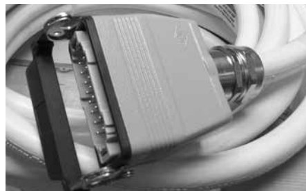
Single Latch Top Entry Style