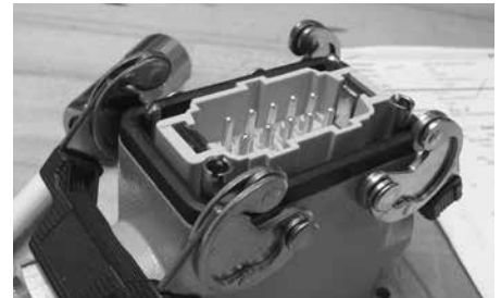
Notice the coding pins that can be used to prevent installation errors