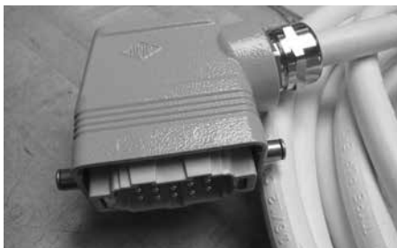
Single Bayonet (2 Locking Pegs) Side Entry Style